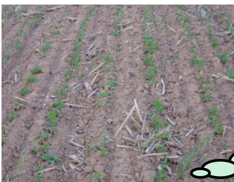
Figure 2 Idea seed bed conditions