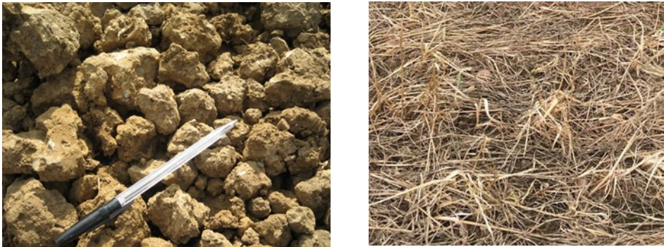
Figure 1 Above—Less suitable seedbeds: LHS Cloddy seedbed and RHS excess straw

Winter Linseed likes a firm, well consolidated seedbed and so is particularly suited to min-till/direct drill situations.