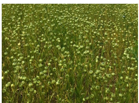
Linseed in Cambridge